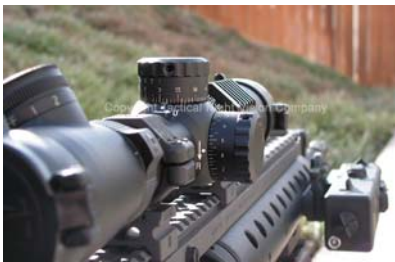
SARS Mounted with (top to bottom), Aimpoint Micro T1, Doctor Optics and RDP II

I hope these units can helps those who need the versatility this ring may provide.